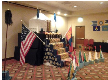
Chinggis Khaan altar